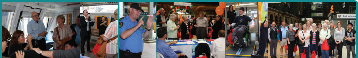
Photos of International Day of People with a Disability - Central Station (November 2010)