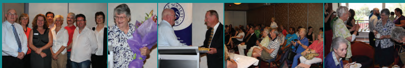
Photos of DSNWS Annual General Meeting (November 2010 at Burwood RSL)