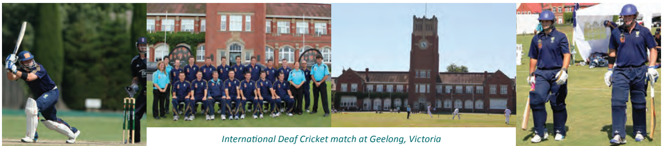
International Deaf Cricket match at Geelong, Victoria

FINAL - England 1/91 defeated Australia 9/90