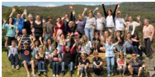
Auslan Only Weekend

On behalf of the DEN team we would like to say thank you to all our AOW participants and congratulations to all our graduating students.