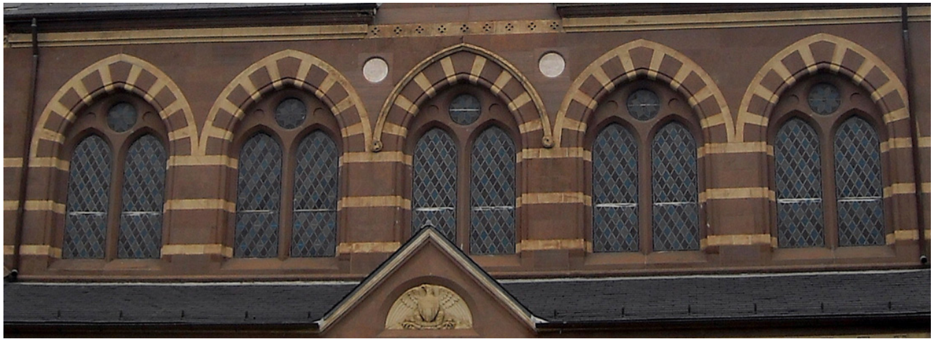
Chapel Hall at Gallaudet University