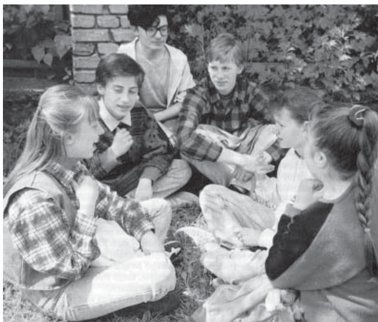
Teens in Poland using Cued Speech in Polish