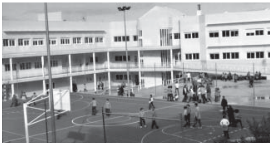
A back view of Colegio Tres Olivos with its playground.

Speech and signs in Spanish word order. The children are integrated and all but two have cochlear implants. Some are implanted bilaterally. Marc and Adoración are working towards having an audiological unit within the school for implant mappings.