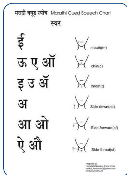
Shown here is the vowel cue chart for the Marathi language of India.

As our (my husband and I) knowledge of Cued Speech is very limited, it would not have been possible to hold such a workshop by ourselves. But luckily, we met a teacher (who is the Principal of the Red Cross school in Pune), who has done a special course in Cued Speech at Gallaudet University. She has caught the bug from us, and has now joined our team. She, my husband and I will practice Cued Speech with each other, before the start of the workshop [once the proposal is approved by the