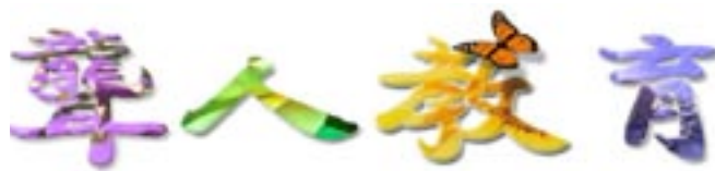
"Deaf Education" in Chinese characters (Deafedu.com)

A seminal moment in Chinese deaf education occurred in 1986 when the Ministry of Education and the National Congress drafted and approved a law requiring all children with disabilities to attend at least 9 years of basic education—the rough equivalent of elementary and middle school education in the United States. Students can fulfill this requirement either through mainstreaming into “regular” schools, where they almost never receive support services, or by attending a residential school program for students with disabilities, located in one of the larger cities. Mainstreaming is considered a measure of achievement for a deaf child while deaf schools are often seen as a placement of last resort, signifying a deaf student’s inability to measure up to hearing students in academic accomplishment. Reflected in these attitudes is