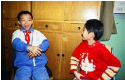
Two deaf boys laugh and talk at Tianjin preschool

to be higher than hearing teachers—especially because hearing educators begin teaching deaf students without being required to take a single course in CSL. Deaf teachers can have an impact on deaf students' cultural and linguistic identity, can become positive role models, and can share a common experience with deaf students that hearing teachers do not possess. Yang argues that bicultural deaf people are able to maintain balance between deaf and hearing perspectives, and that deaf teachers in this role provide a living example of what students can become.