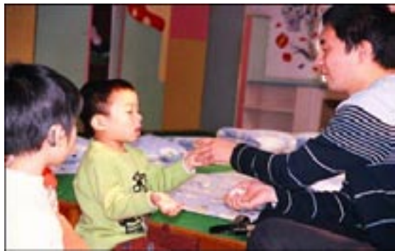
Teacher-student interaction at deaf preschool in Tianjin

Yang's study investigated deaf teachers who are breaking through the barriers to becoming teachers. In June of 2005, Yang sent two questionnaires to 95 deaf teachers whom she had located through various Internet resources, academic conferences, magazines, and newspaper articles. One questionnaire investigated teacher attitudes and perceptions about their roles and the other explored the personal backgrounds of the teachers. Of the 73 teachers that returned the surveys, 12 were invited from 5 cities to participate in one of two focus groups. These focus groups discussed the teachers' reactions to the initial survey and to the collected teachers' responses.