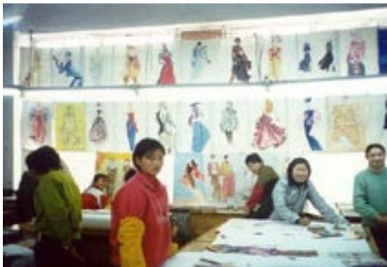
Deaf girls learn visual arts at special school

Deaf teachers expressed desires for increased opportunities in academic teaching and leadership positions on a level equal to that held by hearing teachers. Many deaf teachers (58.9%) taught art and handicrafts but wished that there were more diverse opportunities available to them during their education.