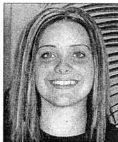
Miss Deaf Utah TEEN 2004

711 Relay Service & ask for 801-288-2159 VOICE