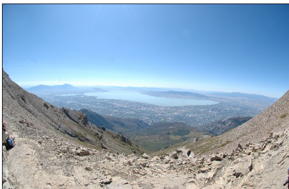
Beauty of Utah Valley from top of Mt. Timpanogos

Hiking to the top of Mt. Timpanogos is one amazing hike. Some people said the view was not worth it but I say it was astonishing. The actual hike is one of the toughest hikes I have been through, but it can be easy at some points. The things to see are very unpredictable there are some babbling brooks with small waterfalls on the trail, remarkable plants, humorous animals, some attractive rock slides, tiny caves, and more. Some of the second, third and fifth graders of Renaissance Academy, the school where I going to, hiked this mountain. Even a five year old hiked this mountain, you can too. Get out there and hike it, but be prepared with foods and waters.